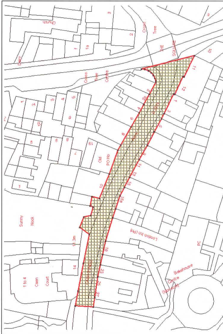
Map Showing Boundary of North Devon Council Air Quality Management Area No.1 - in Braunton, North Devon Reproduced from Ordnance Survey mapping by North Devon District Council under Copyright Licence No.100021929 © Crown Copyright. Unauthorised reproduction infringes Crown Copyright and may lead to prosecution or civil proceedings.